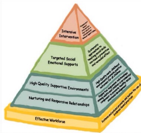
The Pyramid (Program-Wide) Model for Preschool and Early Childhood Settings. Notice the fourth tier on the bottom emphasizing an effective workforce.